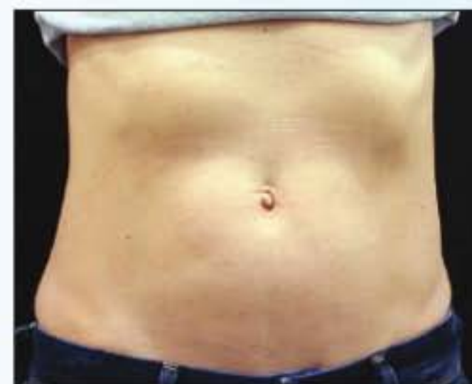
One week after third BTL Vanquish ME Tx