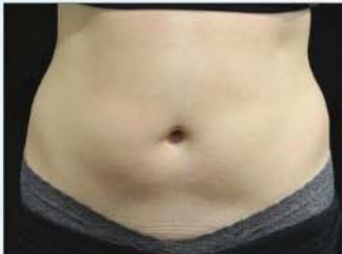
One week after first BTL Vanquish ME Tx