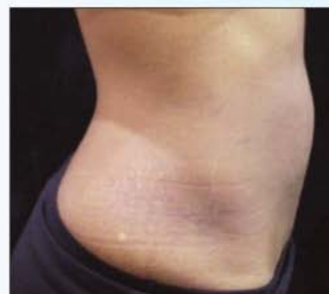
One week after third BTL Vanquish ME Tx