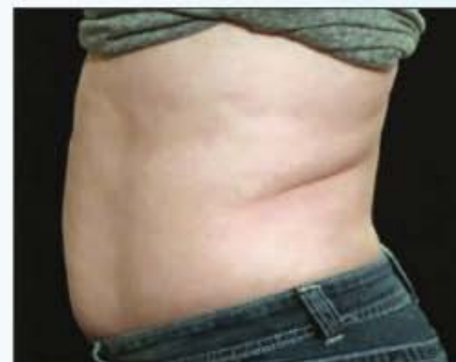
Six weeks after four BTL Vanquish ME treatments